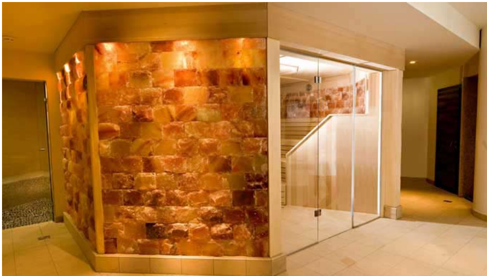
Himalaya Salt Inhalation Sauna – Alpenrose, Lermoos

We were asked to develop a spa and beauty area that unites the existing traditional building and the modern extension. Our planners opted for a modern yet timeless version to avoid running the risk of being outdated in the near future.