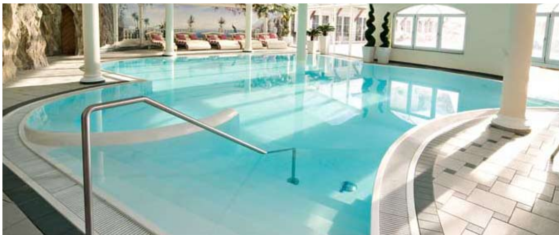
Poolarea – Alpenrose, Lermoos