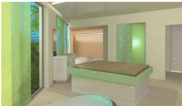
Neptun treatment – Oceana Resort, Dubai

The sun deck has a magnificent view, which can be enjoyed while being pampered with a great variety of outdoor massages. In the Salt Dome visitors can choose from salt socks treatments, salt peelings, salt inhalations and salt baths.