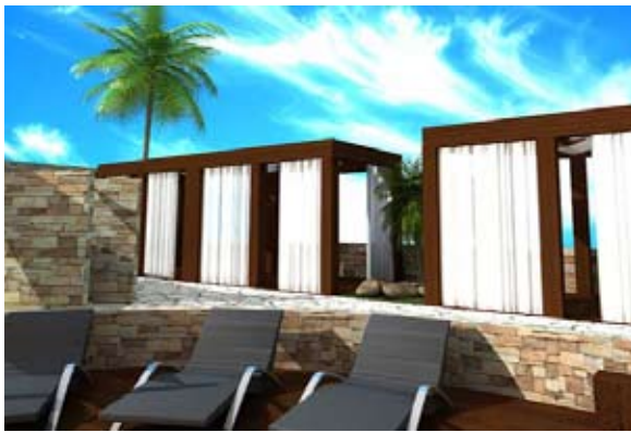
Roof-deck – Oceana Resort, Dubai

A spectacular spa area is designed in a hotel complex featuring two towers which are connected by a glass aquarium bridge. The hotel will be situated at the stub of Jumeirah Palm and will feature the largest Thalasso spa in the Middle East. In addition, a spa club house will be designed directly at the beach. It will offer numerous innovative spa features.