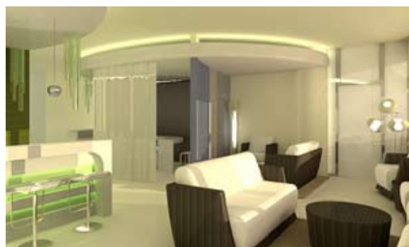
Reception – Oceana Resort, Dubai

Our major challenge was that the indoor pool was too heavy to be held by the glass construction. So we developed an elaborate technological solution to reduce the pool's weight using a stainless steel construction. This resulted in the creation of a unique swimming pool in vertiginous height.