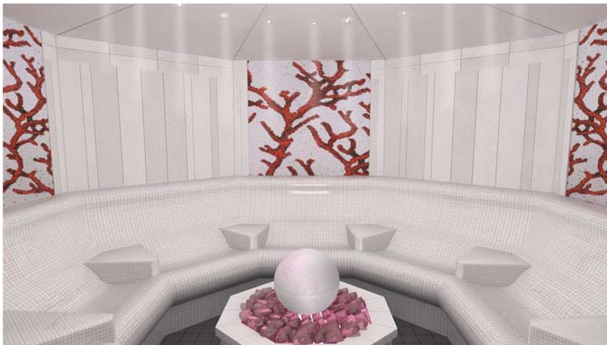
Barrier reef – Oceana Resort, Dubai