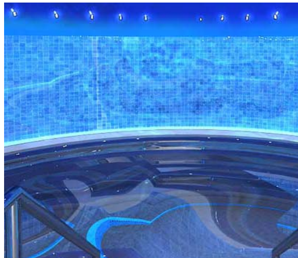
Floating sound pool – Oceana Resort, Dubai

Absolute highlight of the complex is the glass bridge connecting the two towers. The bridge itself features a large swimming pool with various special attractions such as underwater whirlpool beds, neck massage jets, foot reflexology massage jets, full body massage jets, as well as a separate water massage pool. In order to create some kind of aquarium effect, pictures of the ocean and its inhabitants and the underwater world are projected onto the glass. The images can be seen from inside and out. The central theme of the ocean is recurrent throughout the entire spa area.