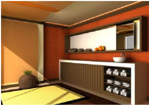
Massage & Shiatsu – Royal Amwaj, Dubai

The Royal Amwaj is situated on the arch that surrounds the Palm Jumeirah and is designed to be a hide-away in the Far Eastern – Balinese style. The Spa Village includes the main building and seven adjacent villas offering a great variety of treatments. The villas are constructed on the water and accessible via outdoor bridge. This high-level spa attracts with authentic Far Eastern flair. Characteristic features of the Asian culture have been integrated in the spa in an innovative and harmonious way.