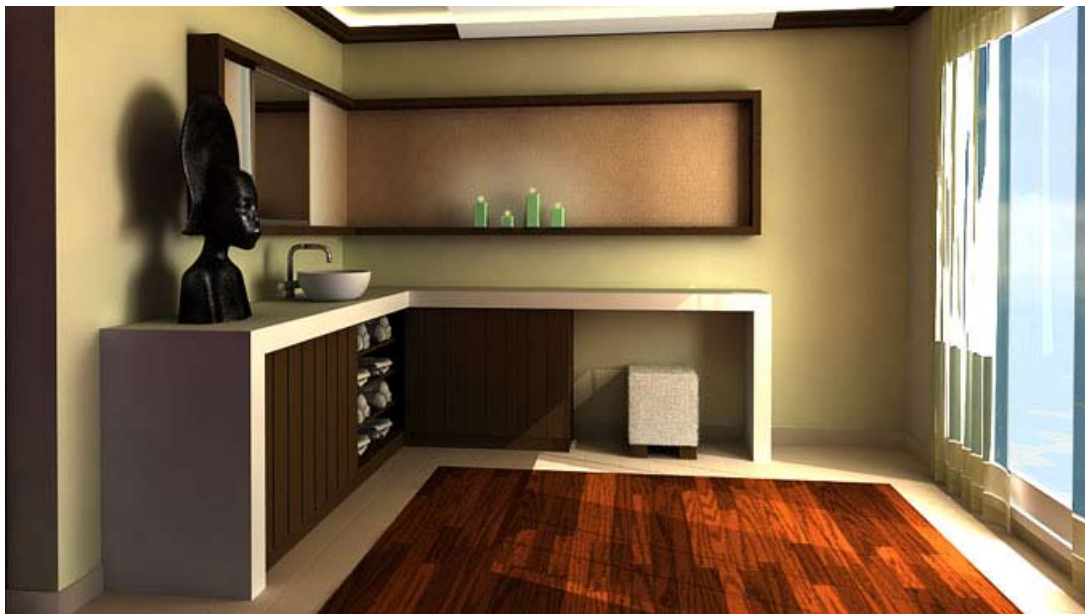
Cosmetic – Royal Amwaj, Dubai