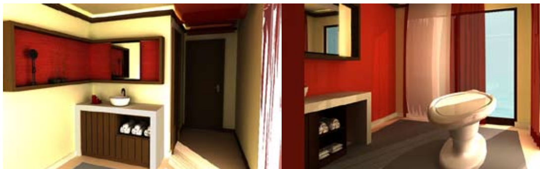
Ayurveda – Royal Amwaj, Dubai