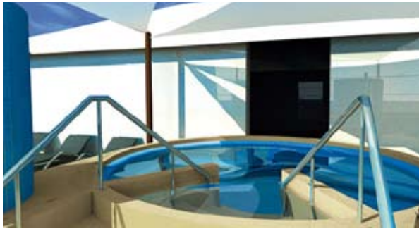
Outside pool – Royal Amwaj, Dubai

They feature multi-sensory showers, steam room/seraglio room, foot and soap brush massages, as well as beauty, pool and shiatsu areas that can be enjoyed in privacy. The other spa villas offer various massages, body cocooning, Ayurveda and special signature treatments.