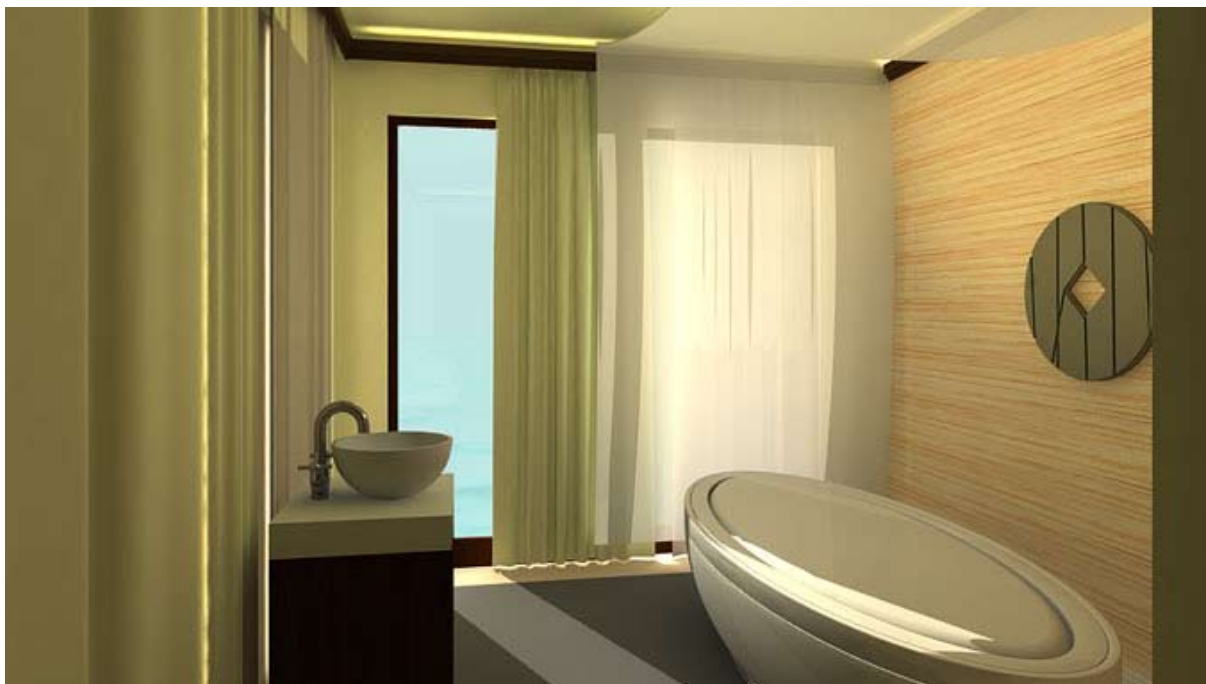
Holistic Cocooning – Royal Amwaj, Dubai