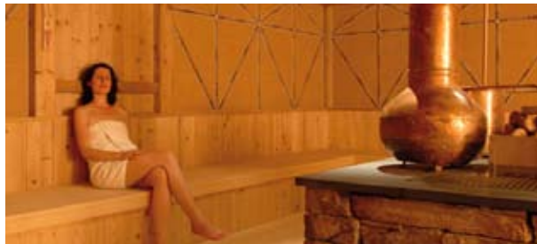
Jungle Village-Herbal bath – Tropical Islands, Krausnick

We are responsible for the spa concept, planning of realisation, tendering procedure and award, project supervision, spa equipment design, turn-key spa, equipment implementation, choosing the right names for the individual spa installations.