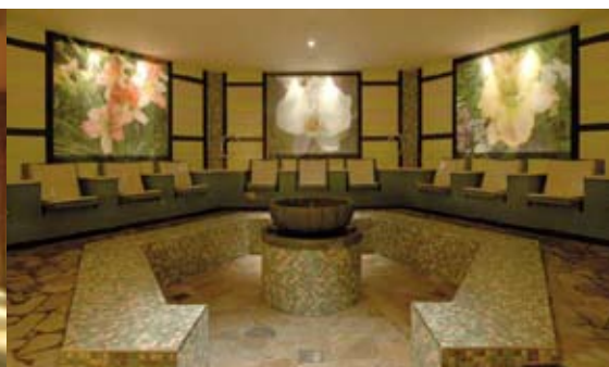
Jungle Village-floral steam bath – Tropical Islands, Krausnick