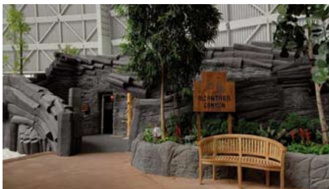
Alcantara-Canyon – Tropical Islands, Krausnick

Ole Bested Hensing, CEO of Tropical Islands