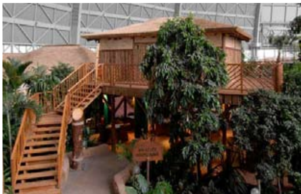
Jungle Village – Tropical Islands, Krausnick