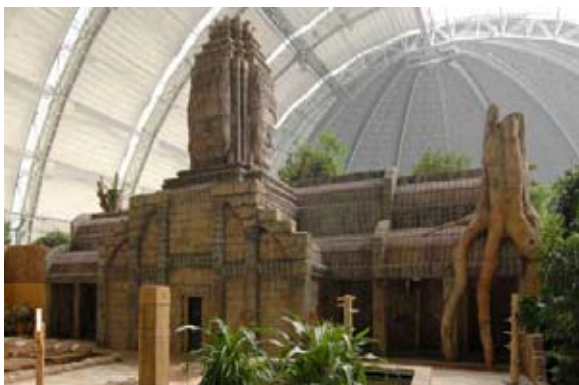
Angkor-Vat – Tropical Islands, Krausnick

The project demands the construction of spa, leisure and entertainment worlds embedded in a lush tropical rainforest setting. The individual spa installations are situated in various buildings that all have their respective themes. The entire spa area is covered by the green roof of a tropical rainforest.