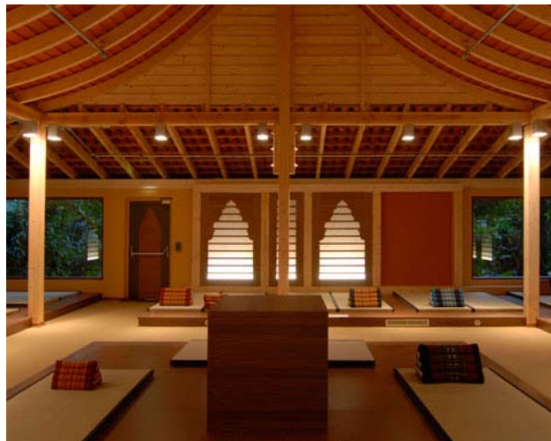
Asia-pavilion – Tropical Islands, Krausnick

Next to the Asian pavilion the visitors will find a replica of Ta Phrom, one of the temples at Angkor Wat, Cambodia. We replicated the part of the temple that features the rudiments of the strangler fig. Here we installed an earth sauna, various multi-sensory showers and a spoon-drift corridor.